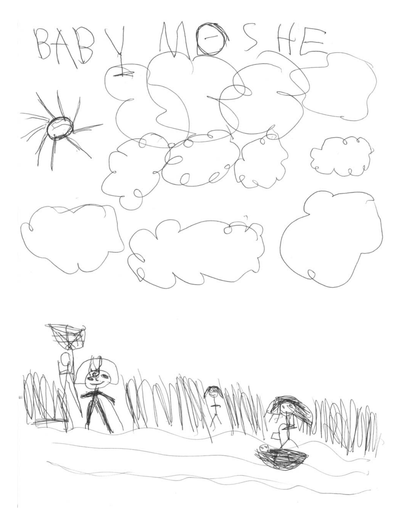
Nessi bat Emunah